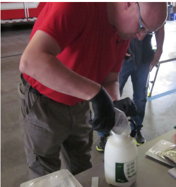
FR Decon in use at a fire and police training session