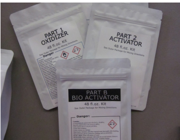
FR Decon mix kit